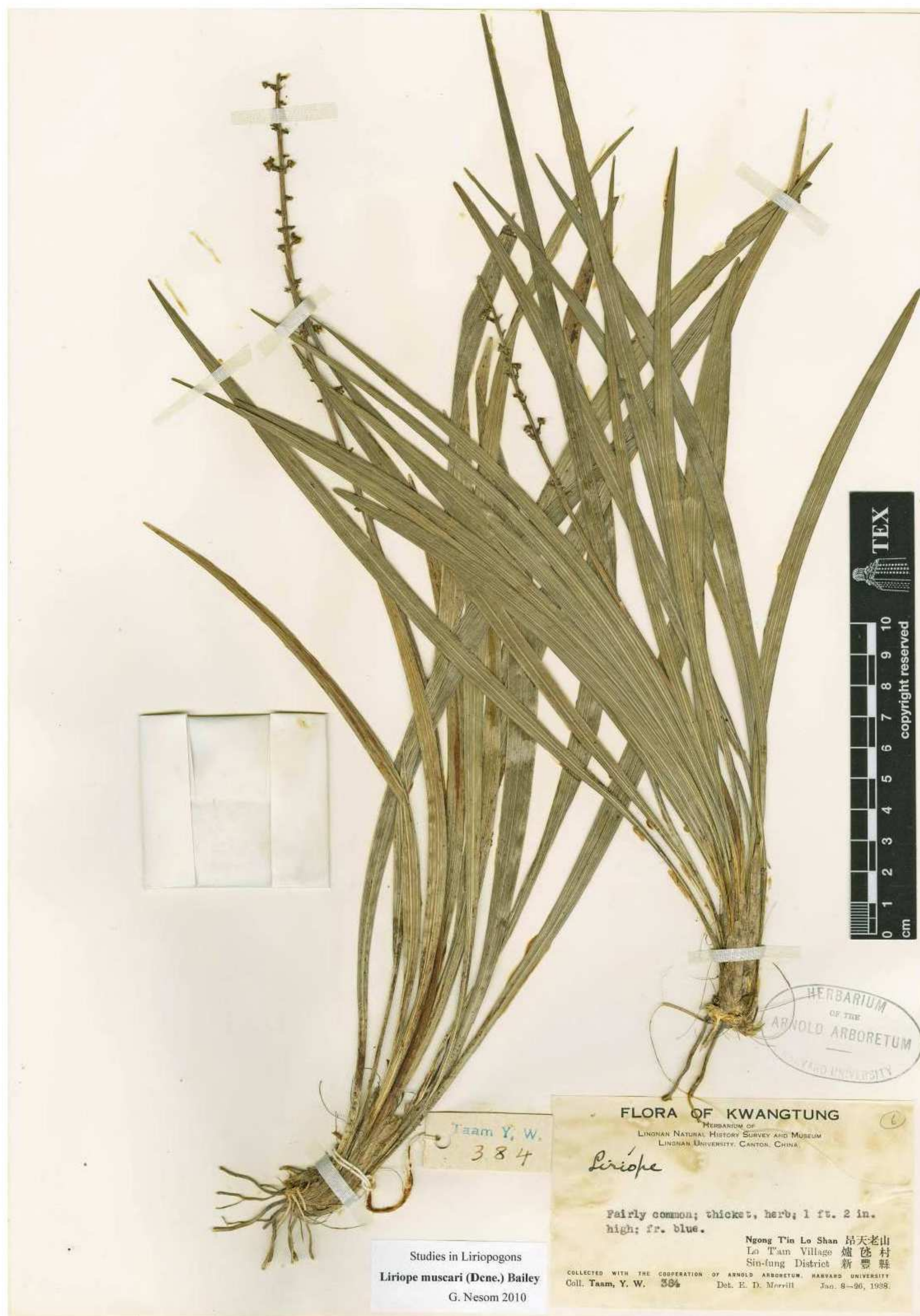
Figure 4. Liriope muscari , typical expression. Base apparently strictly caespitose.